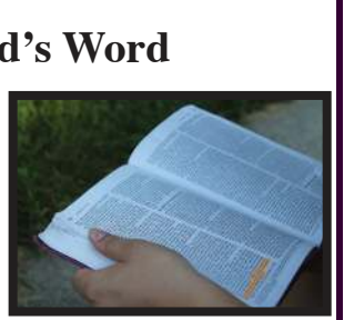
Morning Watch—a time spent in God's Word

Campers spend quiet time each morning reading their Bibles and a devotional. A little later in the day, they will study God's