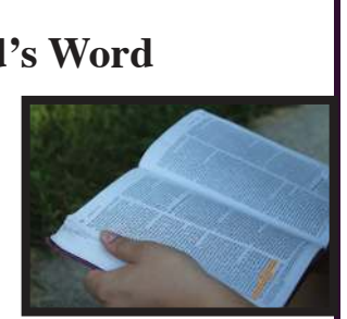
Morning Watch—a time spent in God's Word

Campers spend quiet time each morning reading their Bibles and a devotional. A little later in the day, they will study God's