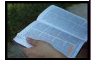
Morning Watch —a time spent in God's Word